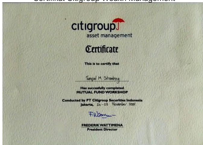
Sertifikat Citigroup Wealth Management