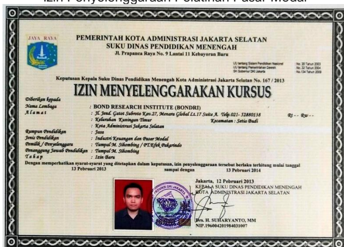
Izin Penyelenggaraan Pelatihan Pasar Modal