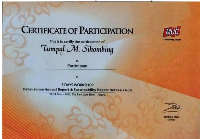
Sertifikat Corporate Secretary